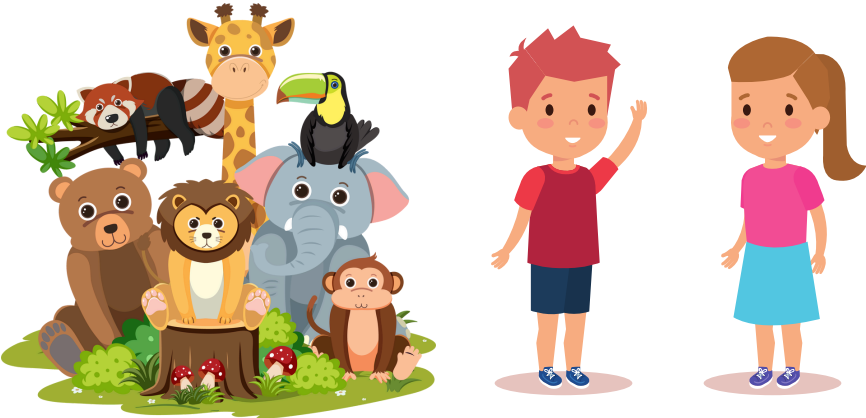
Land animals and People