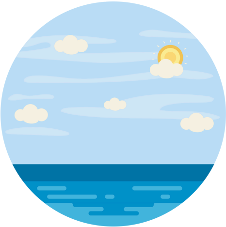
Sky and Sea