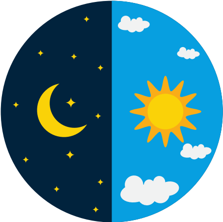
Sun, Moon, and Stars